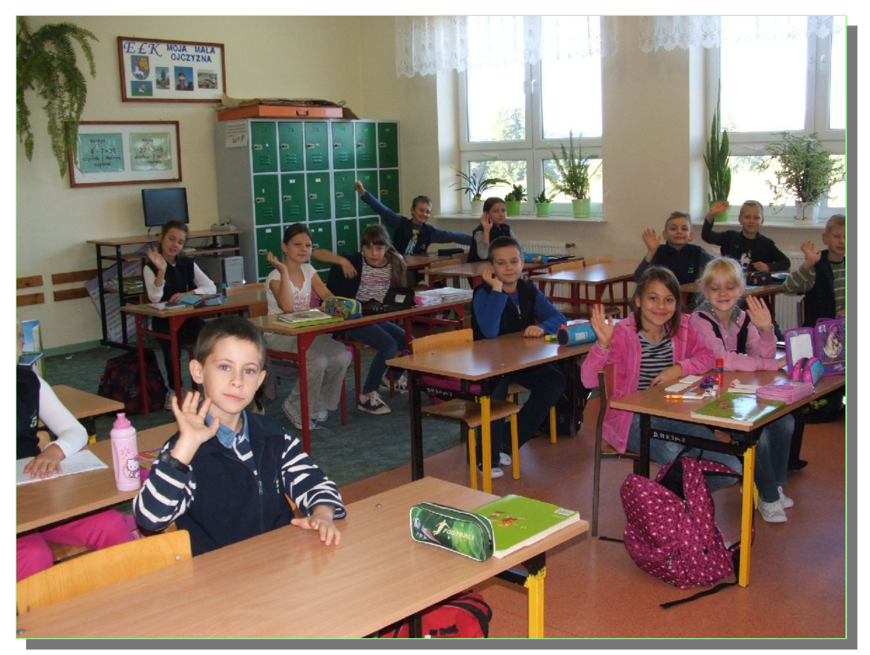
Here are our younger students.