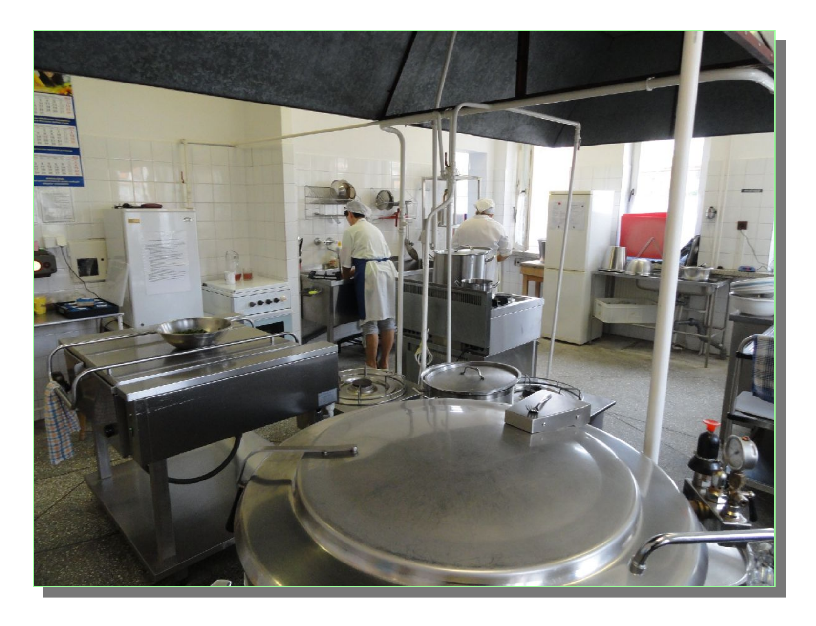
School kitchen. Our cooks prepare delicious meals for us.