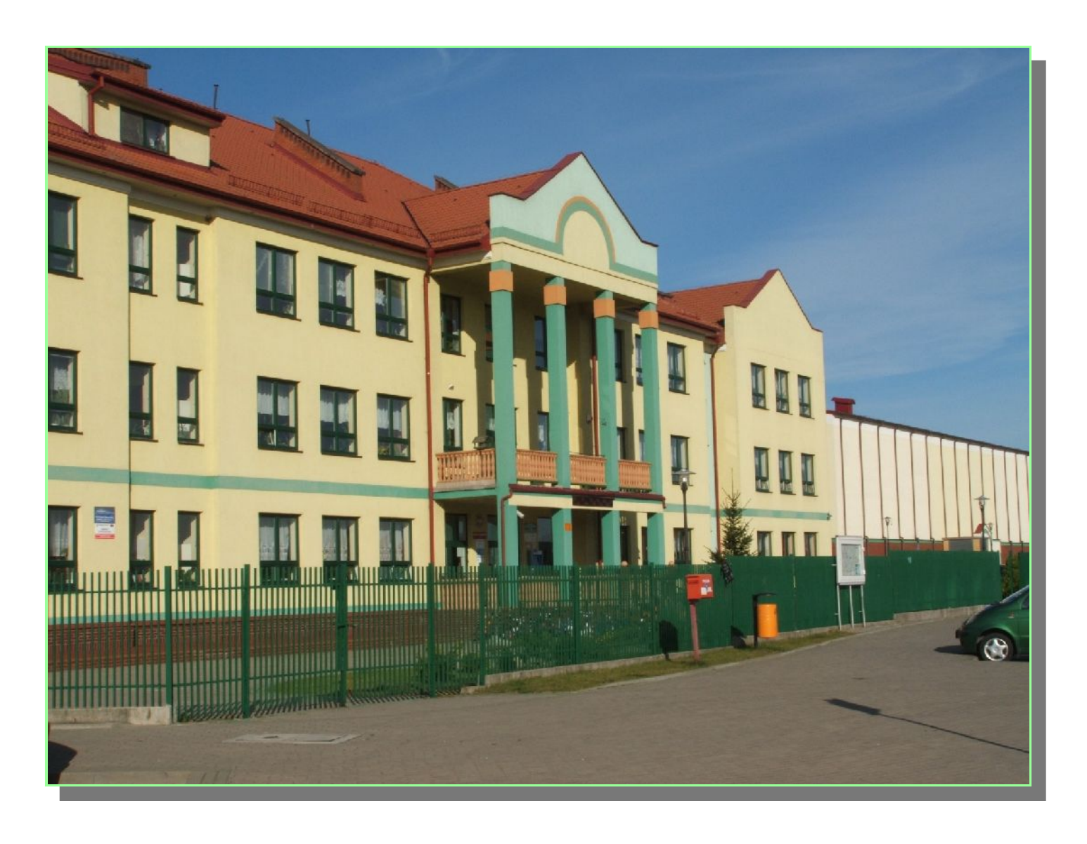
This is the photo of our school seen outside. In front of it there is a spacious car park and lots of greenery.